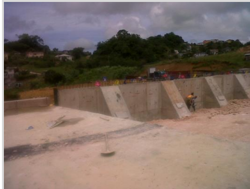
Picture 1 A section of the Christiana Development Road Project